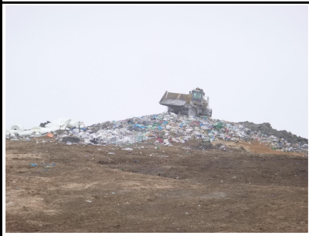
Site: Clinton Landfill 3 (0390055036) DeWitt County