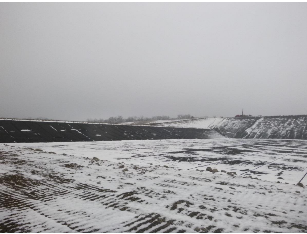
Site: Clinton Landfill 3 (0390055036) DeWitt County