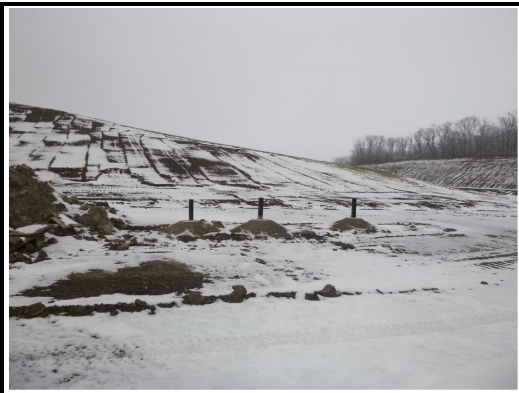
Site: Clinton Landfill 3 (0390055036) DeWitt County