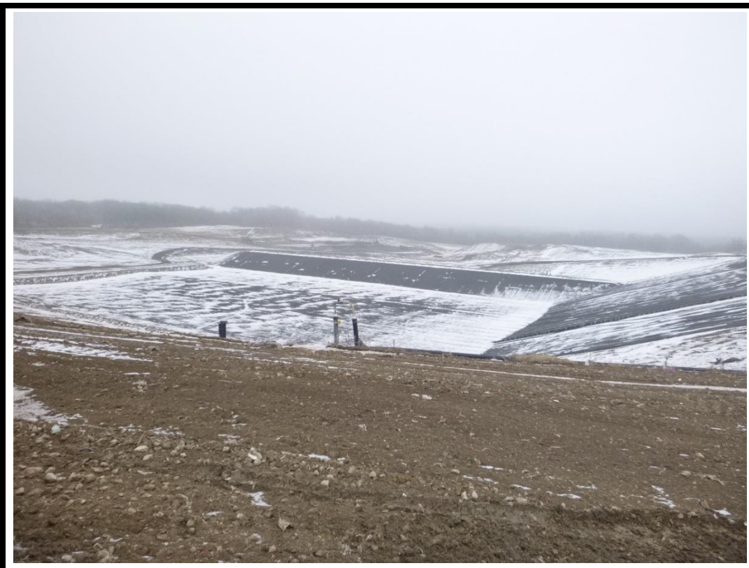
Site: Clinton Landfill 3 (0390055036) DeWitt County