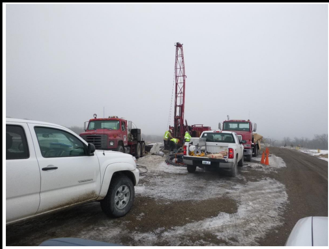
Site: Clinton Landfill 3 (0390055036) DeWitt County