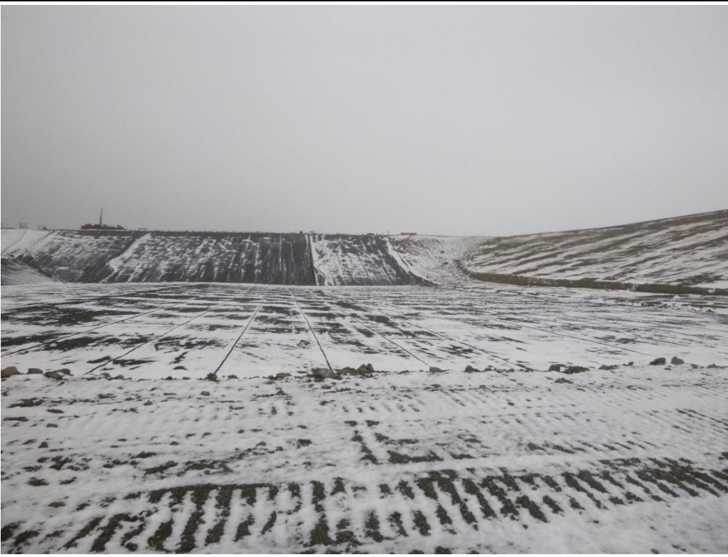
Site: Clinton Landfill 3 (0390055036) DeWitt County