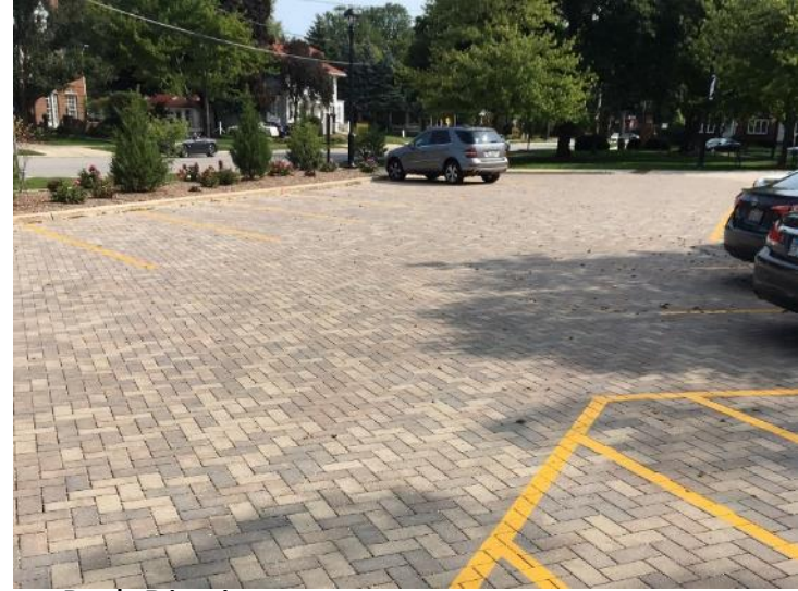
Memorial Park, Wheaton Park District Permeable Paver Parking Lot Conversion, Native Plants, Urban Planter Boxes Nitrogen: 3.5 lbs/yr, Phosphorus: 1 lb/yr