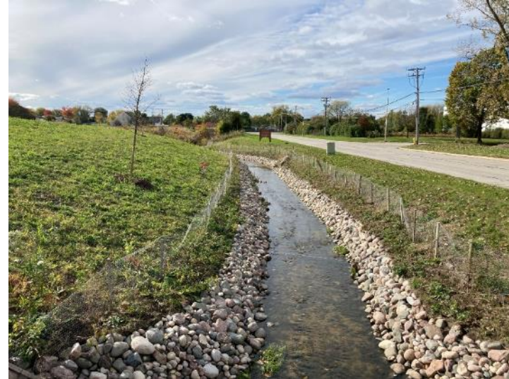
Kehoe Boulevard Streambank Stabilization, Village of Carol Stream Bank Stabilization, Native Plantings Nitrogen: 9.8 lbs/yr, Phosphorus: 3.8 lbs/yr