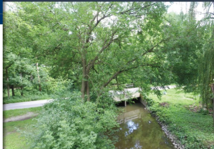
St. Joseph Creek Watershed-Based Plan