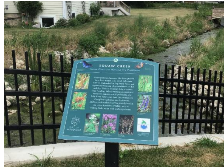
Squaw Creek Stream Restoration, Village of Wood Dale Streambank Stabilization, Channel Improvements, Native Plantings