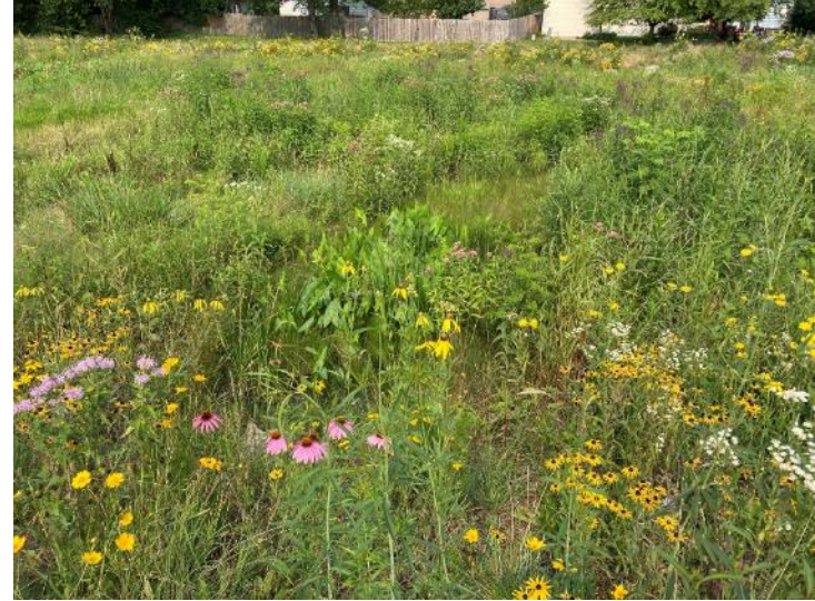
The Park Basin Retrofit, Village of Carol Stream Detention Basin Retrofit, Native Plantings