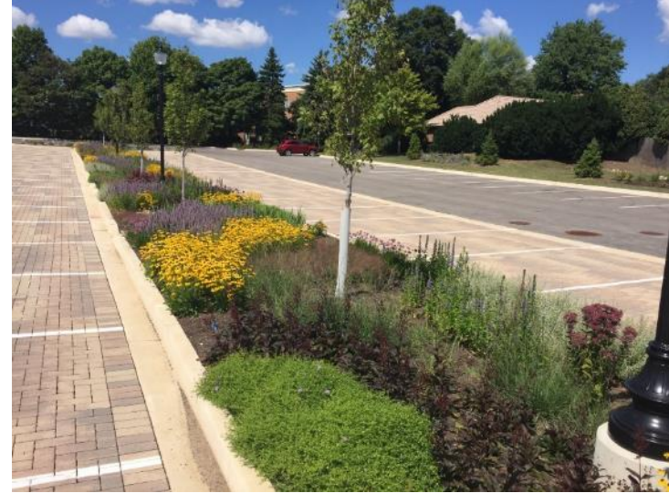
Old Town Parking Lot, Village of Bloomingdale Permeable Pavers, Native Plantings Nitrogen: 19.16 lbs/yr, Phosphorus: 2.44 lbs/yr