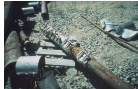
Service Lines Deliver Water to the Customer's Plumbing Connection

Remember that the typical useful life for service lines is 30 years.