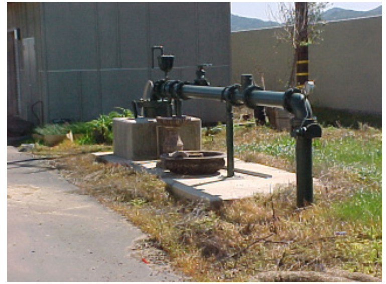
A Ground Water System Well