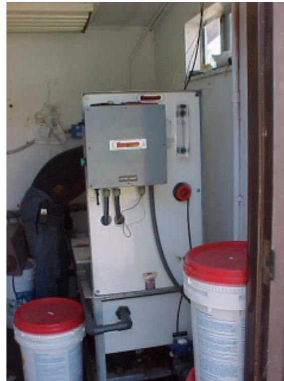
A Chlorination System