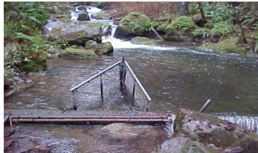
A Drinking Water Intake for a Surface Water System