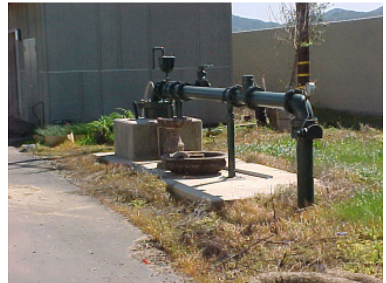
A Ground Water System Well