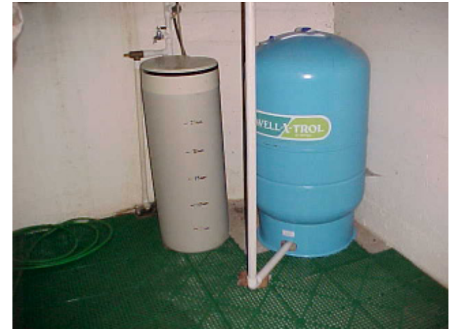
A Hydropneumatic Storage Tank