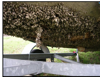
Boat hull encrusted with Zebra Mussels

mussels can cause damage that is costly to repair. While Zebra Mussels prefer warm water and hard substrates, Quagga Mussels can adhere to either hard or soft substrates and can survive in the frigid depths of lakes.