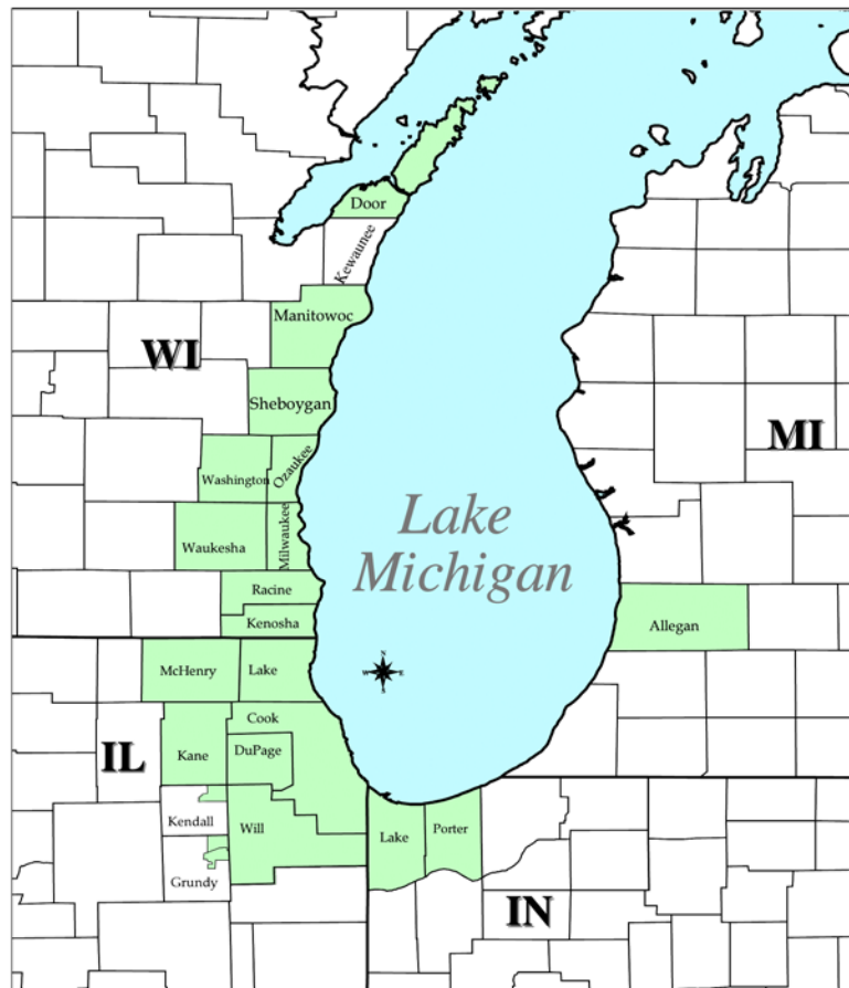
Figure 1.1 Map of the Lake Michigan Ozone Nonattainment Areas

The following is a list of the counties, and portions thereof, contained in the Chicago 8-hour ozone severe nonattainment area: