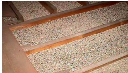
Vermiculite insulation between attic joists