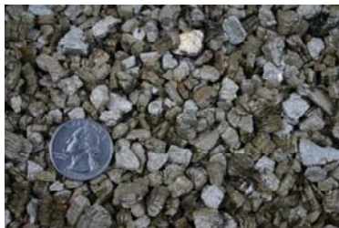
Typical vermiculite insulation

Look at the photos on this website and then look at the insulation without disturbing it. Vermiculite insulation is a pebble-like, pour-in product and is usually gray-brown or silver-gold in color.