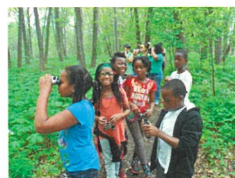
Chicago school children learn about nature at restored FPDC locations.