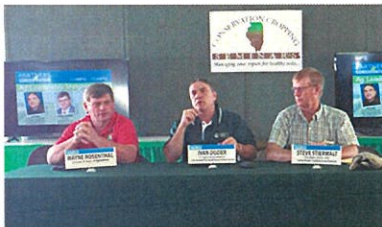
IL Ag leader panel discussion Aug. 2017.

NRCS participated in the 2017 Farm Progress Show held August 29-31 in Decatur, Illinois. The Partners in Conservation Tent housed 21 organizations that pooled resources to have a powerful presence at the show. The groups held nearly 20 panel discussions on conservation topics and offered a soil health demonstration. A soil pit was created onsite, which the crowd especially enjoyed. NRCS and partners showcased the installation of a Denitrifying Bioreactor, a new conservation practice designed to improve water quality and support the Illinois Nutrient Loss Reduction Strategy. It was a great show!