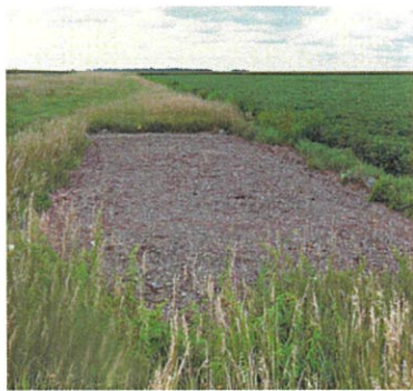
Denitrifying Bioreactor in Piatt County.